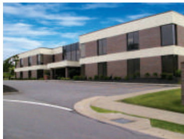
Office at Rochester