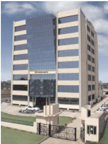
Office at Mohali